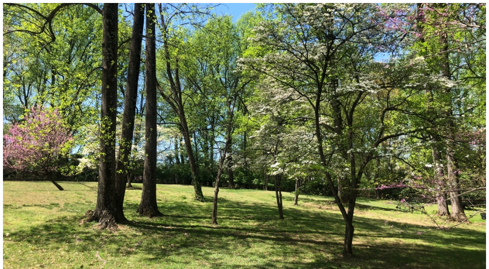
Monument Park will be the site for the West End SpringFest neighborhood picnic on Sunday, May 19, 2024 from noon to 3 p.m.

The meeting will take place on Thursday, May 9 at 7 p.m. in the Calvin Meeting Room of the Rockville Presbyterian Church, with parking and meeting entry at 210 Harrison Street. All West End residents are welcome!